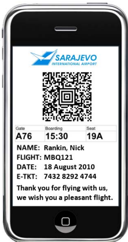
Picture: Optimised mobile barcoded boarding pass

Sarajevo Airport, Bosnia and Herzegovina's main international airport, has announced the launch of a new mobile barcoded boarding pass delivery service for all passengers